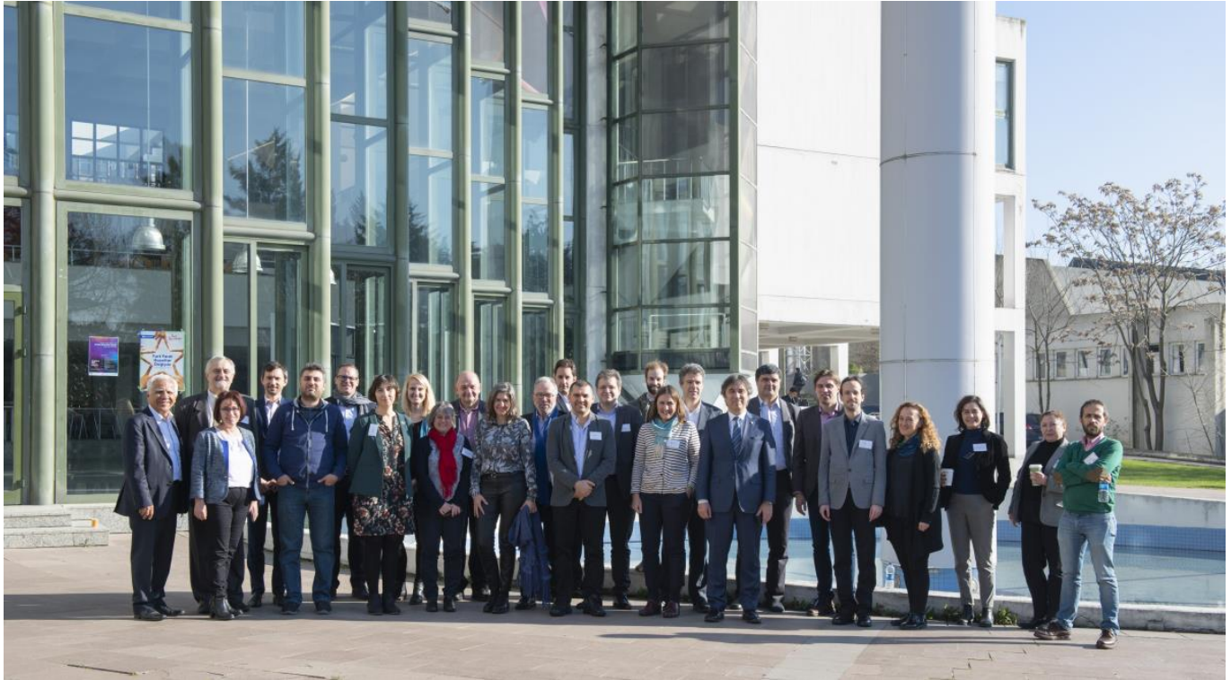
Photo taken on December 17th 2019 at the EELISA meeting at ITU (Istanbul) event

helping to bring their students and staff closer together for the creation of a European engineering degree. They will also share their experience in education related to industry and research, and address societal challenges such as green, smart and resilient cities and Industry 4.0. ENAEE brings unique experience in European cooperation in the sector.