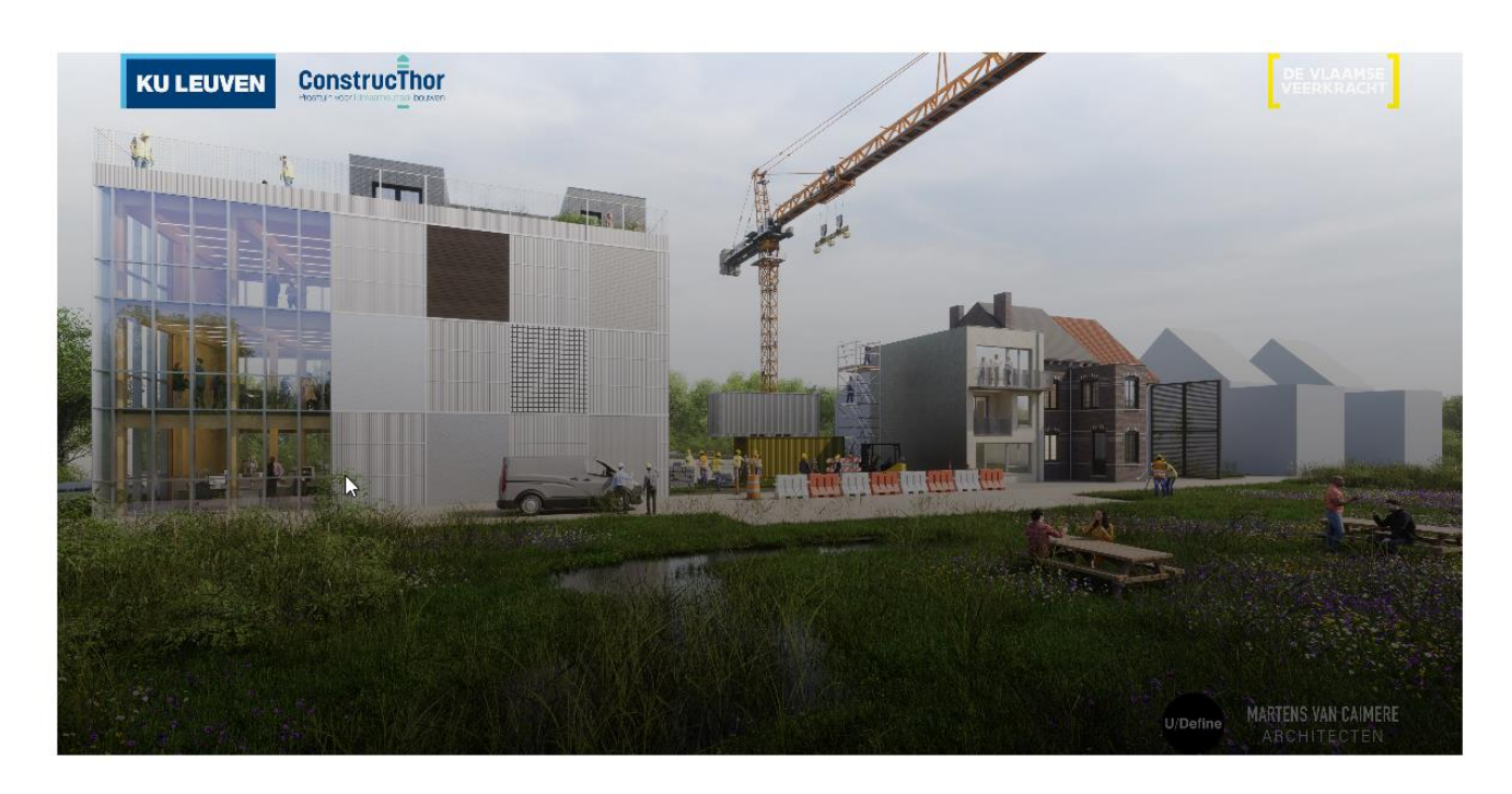
Beeld door Martens Van Caimere Architecten & U/Define

<u>Project ConstrucThor - contributing to solutions and help building a new climate-neutral test</u> infrastructure