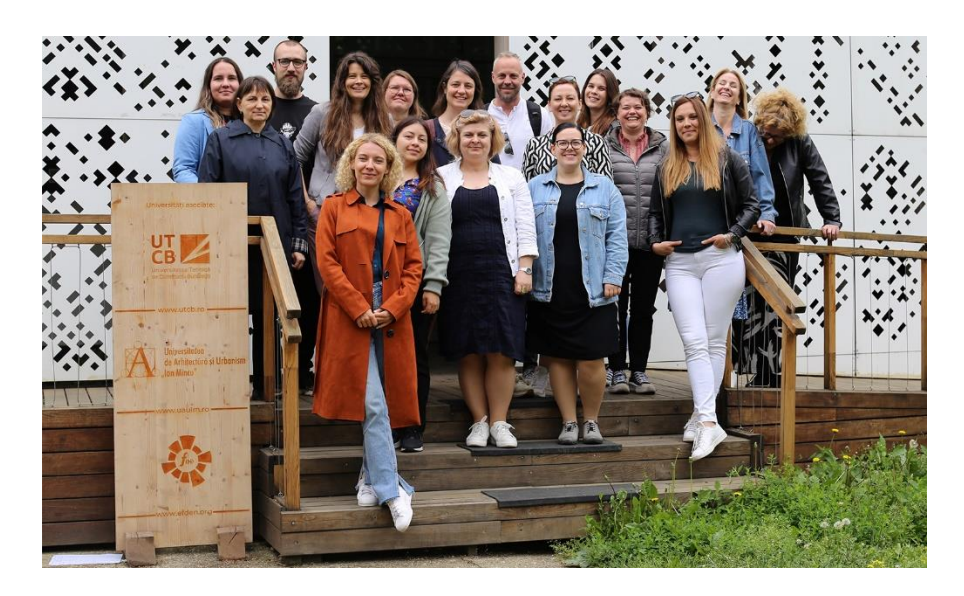
Group photo with the participants taken in front of the EFdeN house at the Faculty of Building Services Engineering of UTCB

During May 20-24, Technical University of Civil Engineering hosted the first edition of the event entitled International Staff Week , bringing together representatives from five universities from France, Spain, Germany, Ireland and Croatia!