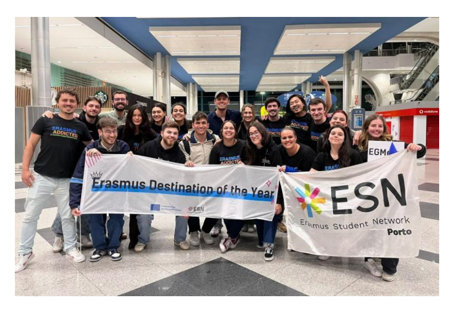
ESN Porto volunteers at EGM Seville 2024 with their flag and the flag of the Erasmus Destination of the Year

All ESN local associations were encouraged to apply, either by joining forces or individually, if there is only one association in the city. After an internal evaluation, Porto, together with runner-ups Nicosia and Sofia, Istanbul and Sevilla, made it to the finals, which led them to presenting their city in front of the 1,600 participants of EGM Seville 2024. Next to the vote of the audience at the conference, the external jury made up of representatives from the European Commission, EAIE, Academic Cooperation Association, European Youth Forum, and Young European Federalists decided on the winner, taking into account important factors such as collaboration with key stakeholders, Higher Education Institution(s), the municipality and other local partners ensuring a quality mobility experience for students.